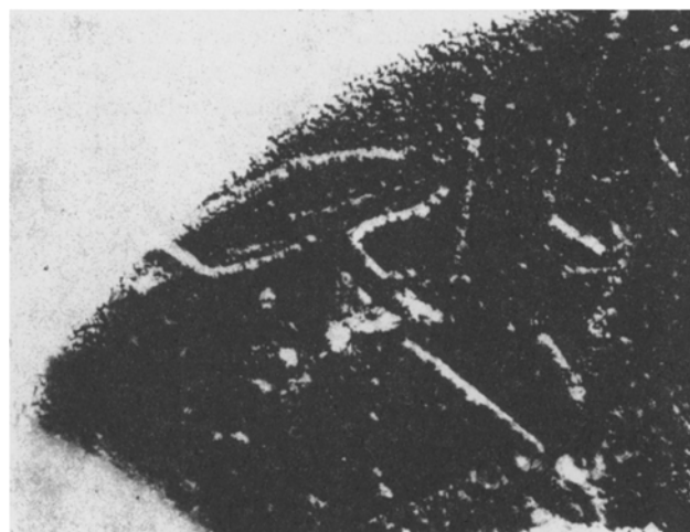
Fig. 3. A recombinant of 6th passage A2 virus, adsorbed on chicken RBC. Shadowed with phosphotungstic acid. 20,000 \times .